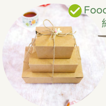
✓ Food Cartons 紙餐盒