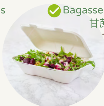
✓ Bagasse Takeaway Boxes 甘蔗渣外賣餐盒